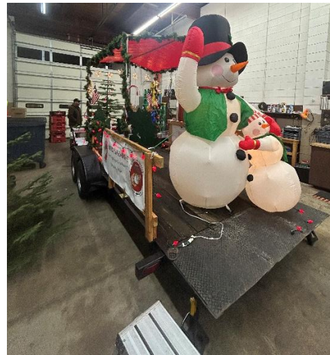
Float preparations. Friday December 5, 2025. My-Comm shop.