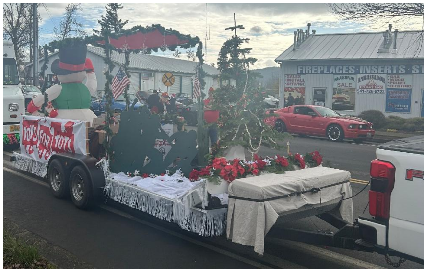
Waiting for the 2025 Springfield Christmas Parage to start.