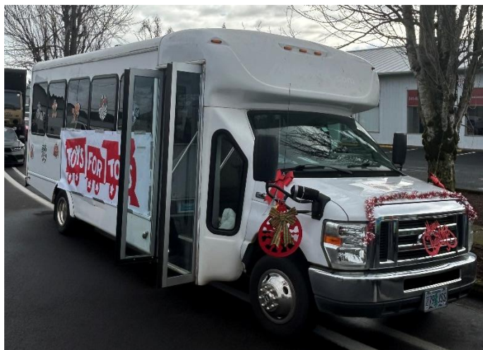
Emerald Empire Young Marines, 6 December 2025, Parade Staging.