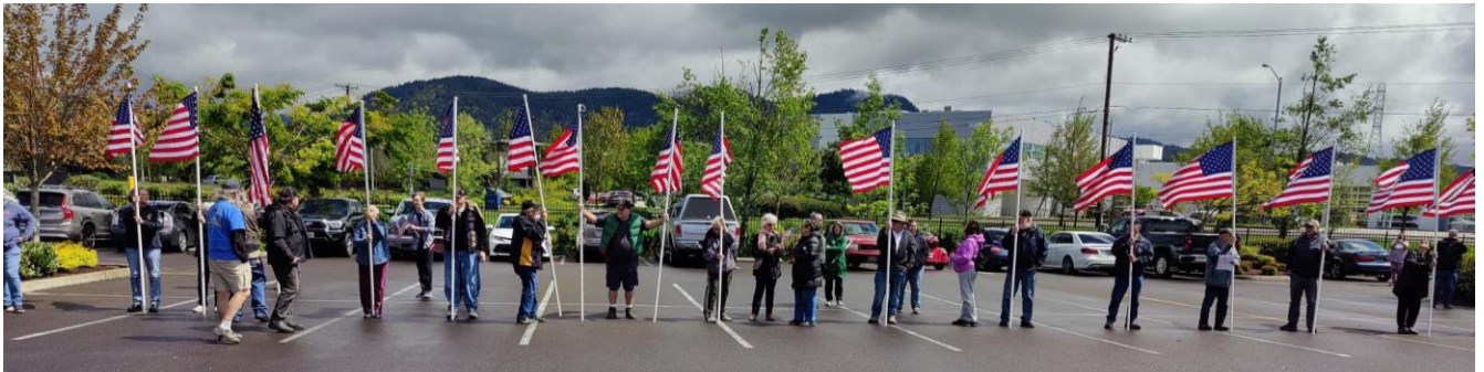
Preparing for the WELCOME HOME, 29 April 2024.