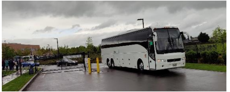
On their way.