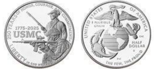
U.S. Marine Corps 250th Anniversary 2025 Proof Half Dollar