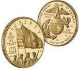
U.S. Marine Corps 250th Anniversary 2025 Proof Five-Dollar Gold Coin