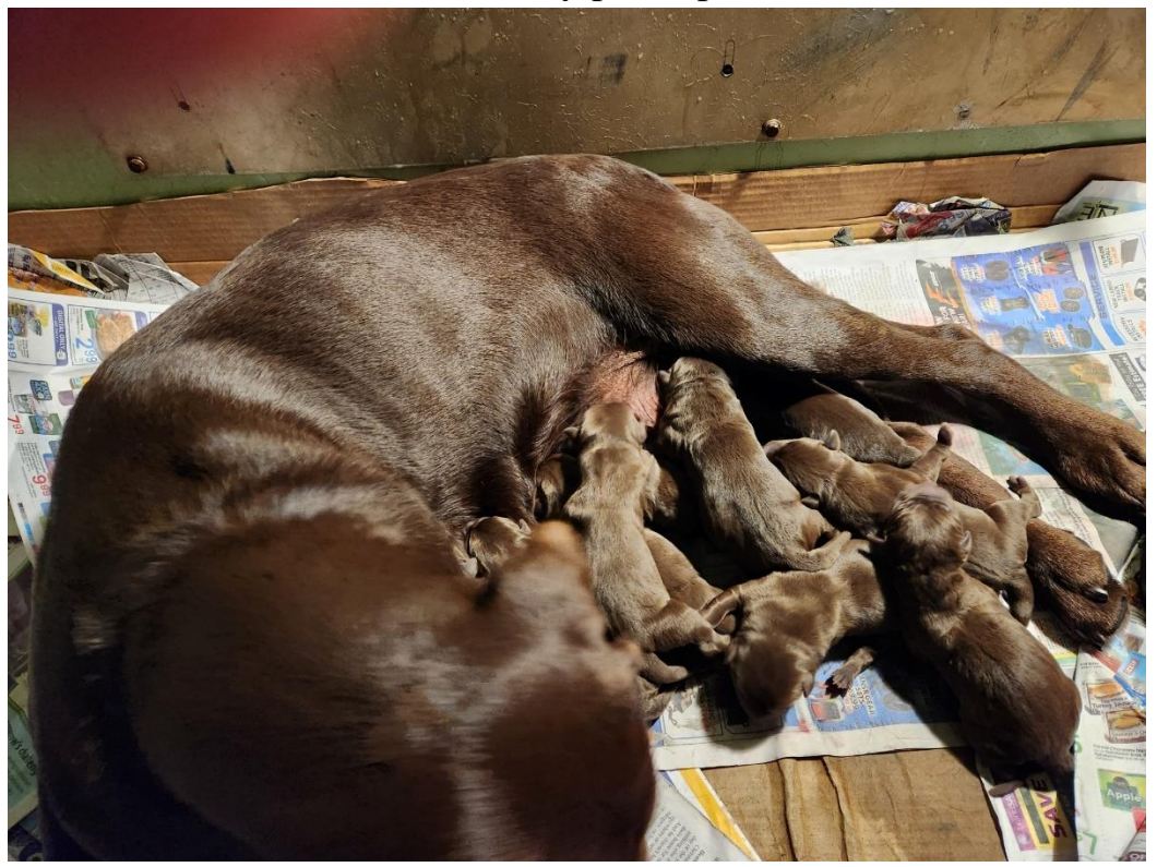
The 11 newest members of the Bowker family.