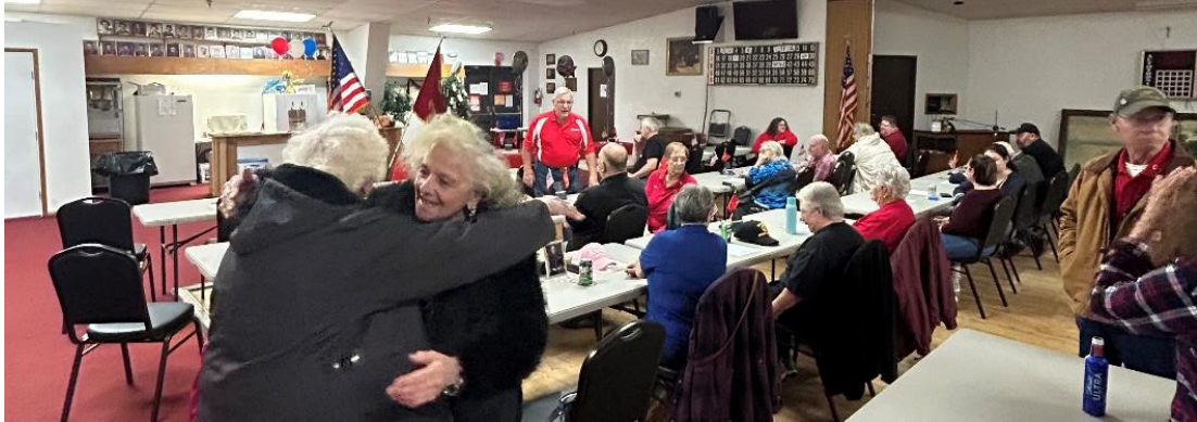
The first part of the program was the arrival and social visting.